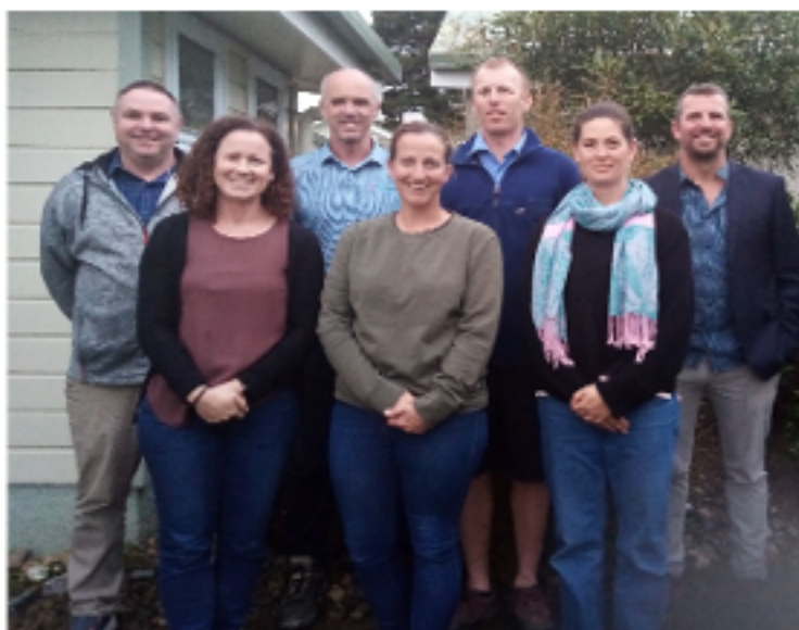
Tasman School Board of Trustees

This is an excellent opportunity to reflect on progress to date, meet Board of Trustee members, ask questions, and find out more about what we do. Come and see us in Kākāpō classroom, after the Matariki celebration on Wednesday 28 June, around 6pm.