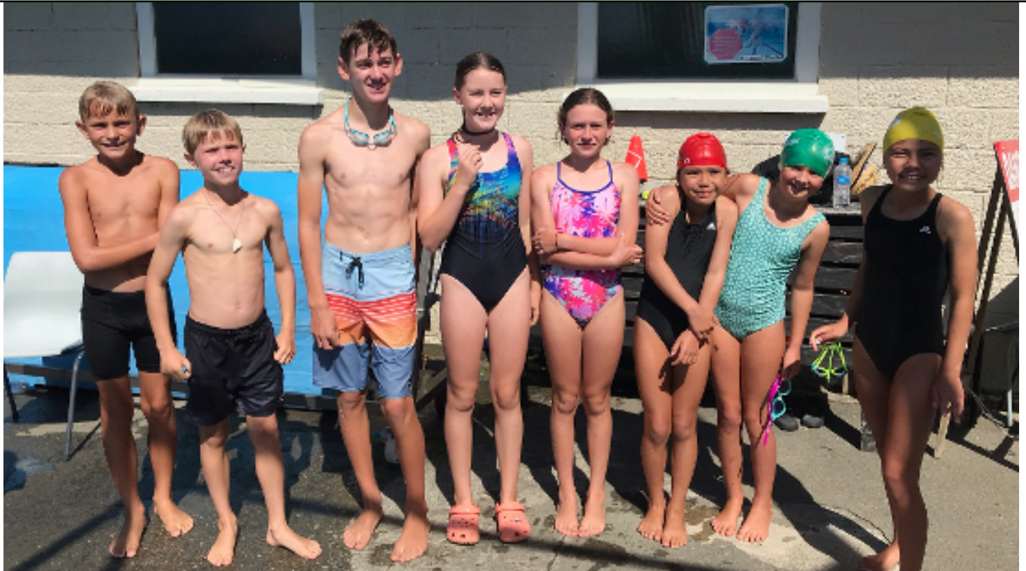
Motueka Swimming Sports Winning Relay Team