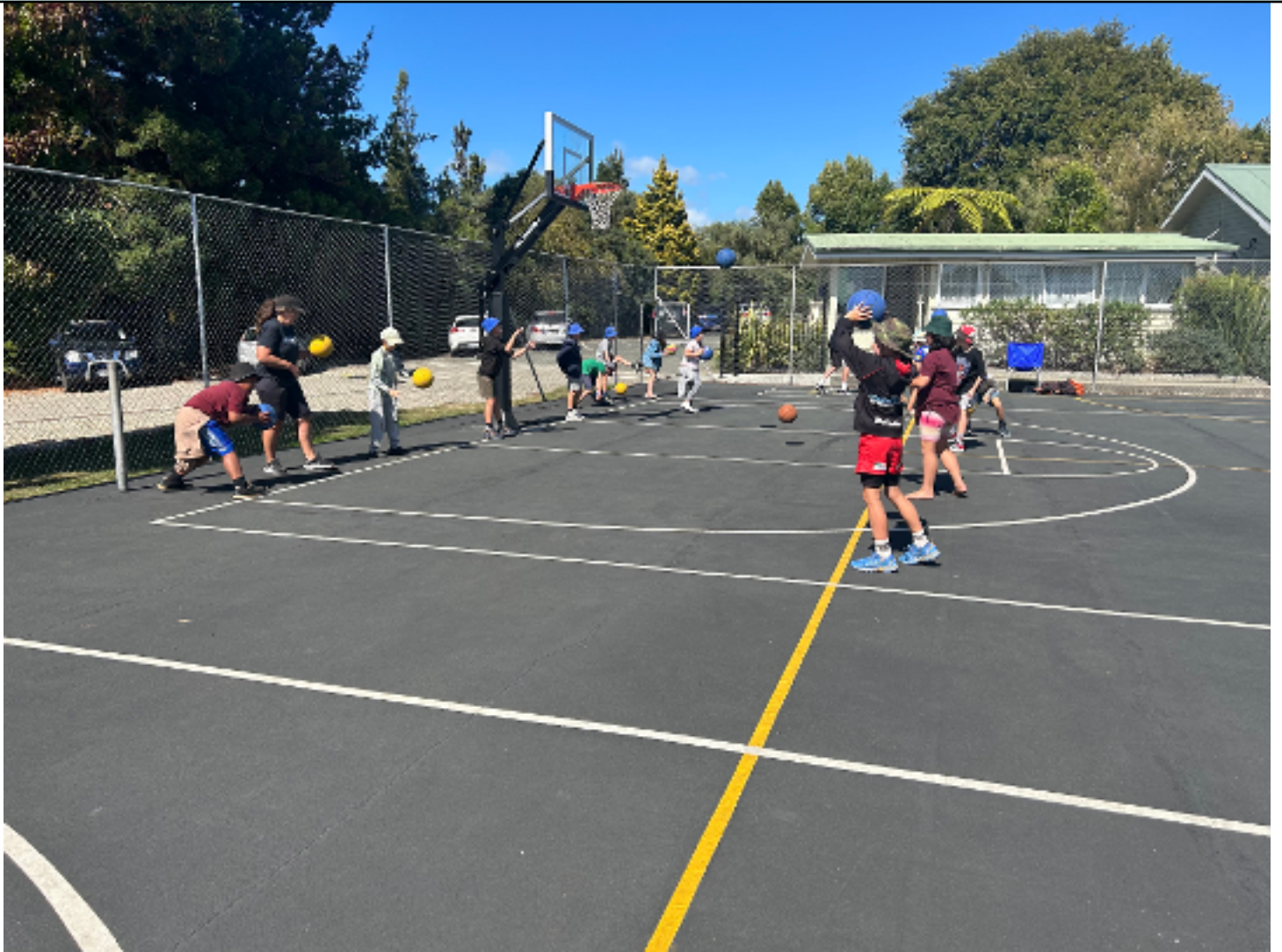
Basketball Skills Session.